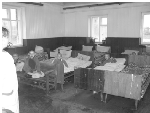
One of the rooms that was rebuilt in 1999.