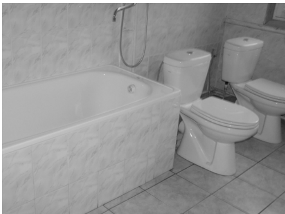
One of three new bathrooms at the Romaniv orphanage.