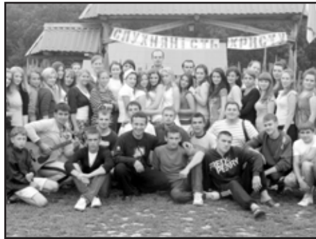
Youth from Berdichev, Ruzin, Stanishevka & Ray