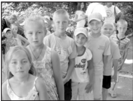
"Following Christ" theme for Children's camp

This year we had over 400 children and teenagers attend camps in various areas of Ukraine. Many of these are children or teens who have attended camps in past years. There were 34 salvation decisions!