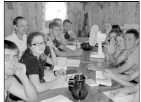
Bible study is a special time