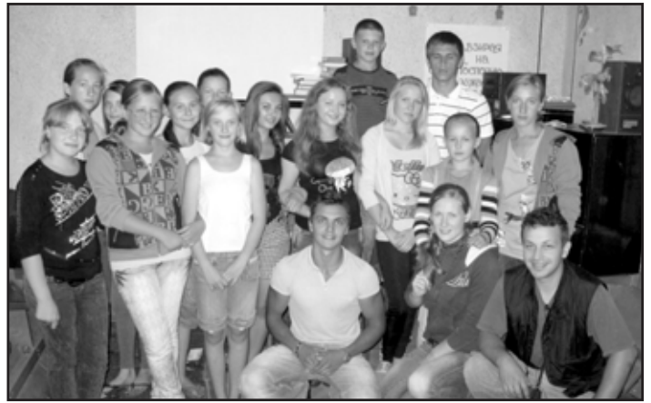
Ministry to teenagers in the village

Teenagers and young people gather every Monday around the Word of God. So nice to see them when they pray, speak, study the Bible, memorize key verses teach, then drink tea together.