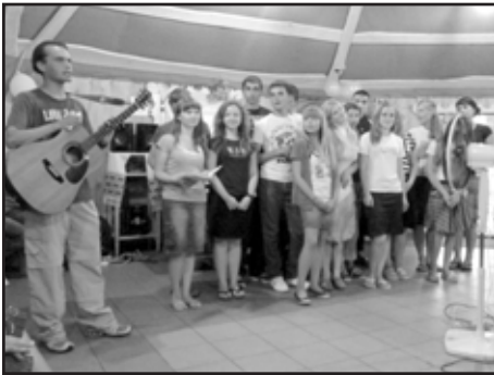
Singing in the evening service