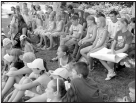
Listening to God's Word