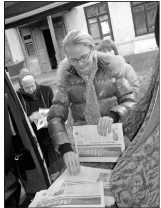
Distribution of the Mayak paper

Dear brothers and sisters! I have no money to subscribe the newspaper "Mayak" and want to ask you whether you have any possibility to give me the subscription of that newspaper as a gift. Forgive me if I am too daring but the Lord said, "ask and it will be given to you" so with a prayer I ask you to help me get "Mayak" for the glory of God.