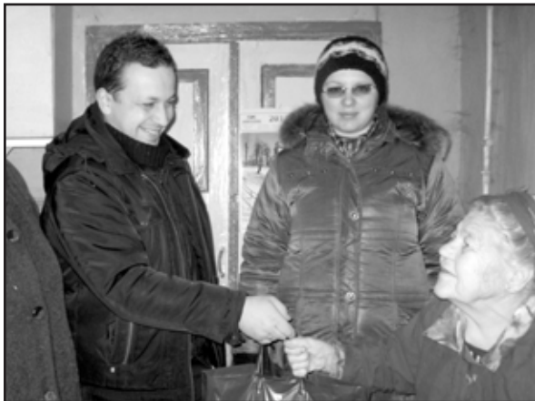
Helping the needy, poor and lonely

The last time we use a method of evangelism - a practical help in the household. Many people in the village heated their homes with wood. And they are often faced with the problem - how to cut. Therefore, seeing this need, we bought a chainsaw. And many times I used it to cut firewood lonely people and widows. And also for heating the house, where our church comes temporarily.