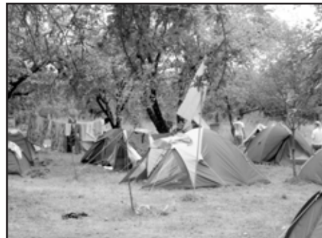
"Tent city" for youth camp