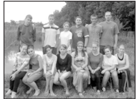
"Obedience to Christ" was our theme

This year we had over 400 children and teenagers attend camps in various areas of Ukraine. Many of these are children or teens who have attended camps in past years. There were 34 salvation decisions!